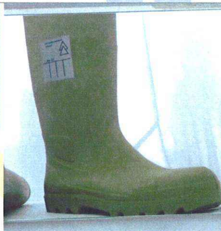
Particular of the sole